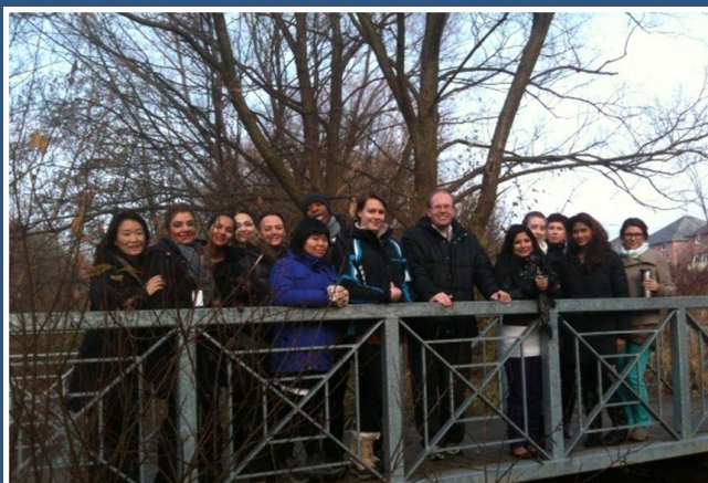
Our Elementary Teachers in Training realized: You're never too old for a nature walk!