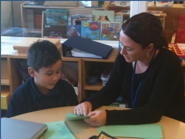
Each day our Elementary Teachers in Training engage with TMS students, putting theory to practice.